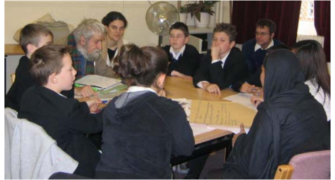
Students acting as UN Special Rapporteurs interviewing experts from NGOs about refugees, water, homelessness...