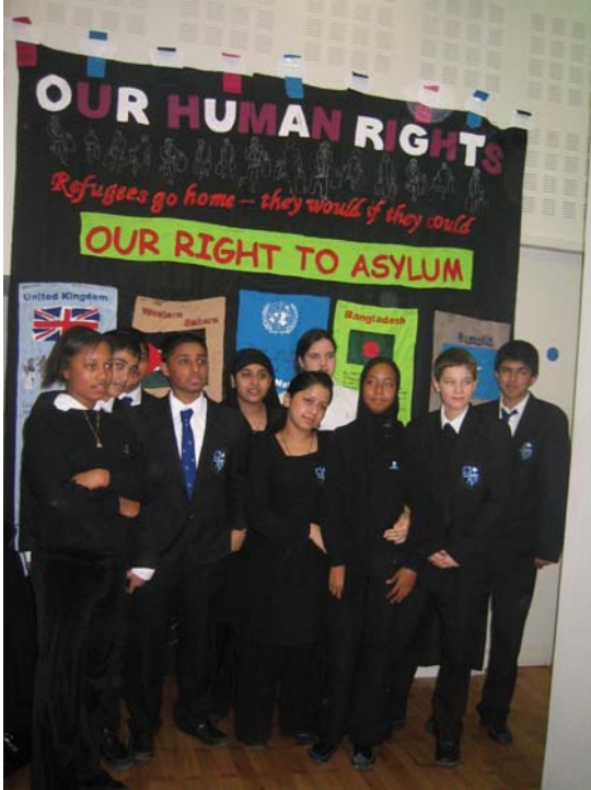
Morpeth Students celebrating their work on human rights and the issue of Asylum.

Three Tower Hamlets Secondary Schools and a Newham School took part in human rights conferences, interviewing experts from NGOs and creating reports, animations, banners and raps as they learnt how to be UN Special Rapporteurs. The project was recommended to Heads of English in Newham as a module for KS3 English, and is fully accessible as a webquest on London Grid for Learning.